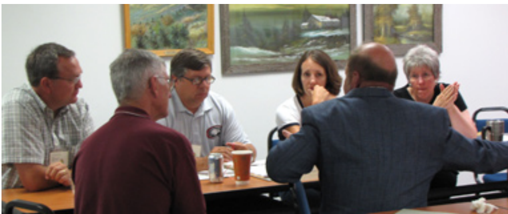
Land use was a big topic of discussion in Chadron

Families are breaking up their property and selling and leasing their houses. Acreages are popping up and SMAC, or small acreage challenges,