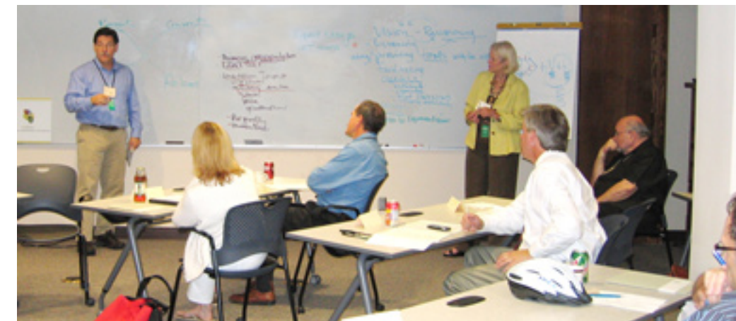
Effecting public policy quickly and nimbly is crucial to addressing sustainability issues